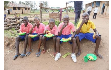
Newly introduced school lunch