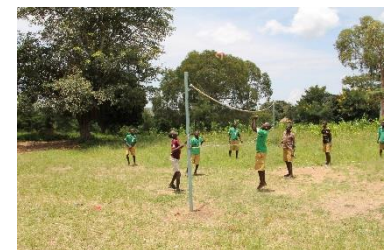
Introduction of sports activities at school